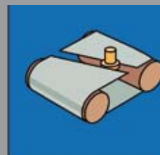
Milling belt ends